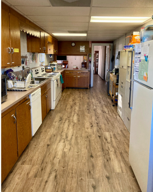
The former kitchen, "Old Faithful"

Five years ago, in Springwood's 150th Anniversary year, our leaders considered the future of Springwood's ministry. How could we best steward the resources God gave us long ago? How could we be a church for future generations? Our kitchen was no longer sufficient, and our small rooms in the Educational Building were not being fully utilized.