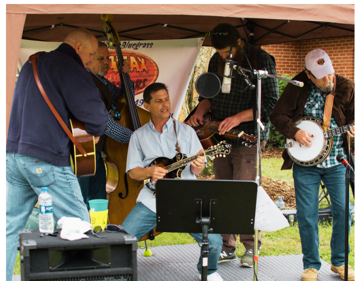
Hotwax and the Splinters