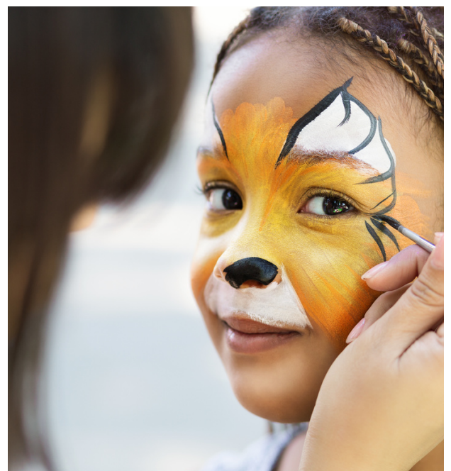
Fun for all ages!

Springwood Church Fall Festival , Oct. 28 (Springwood Church, Whitsett) - The main event! This is our chance to offer our community a great day of fun and entertainment as we serve and get to know our neighbors. We would love your volunteer enthusiasm and community spirit as we provide children's activities, a bluegrass band, food from our new kitchen, and much more. Are you a great organizer? Can you set up or take down? Do you have a (not so) hidden talent (i.e. face painting, etc.)? Call us and we'll find a place for you!