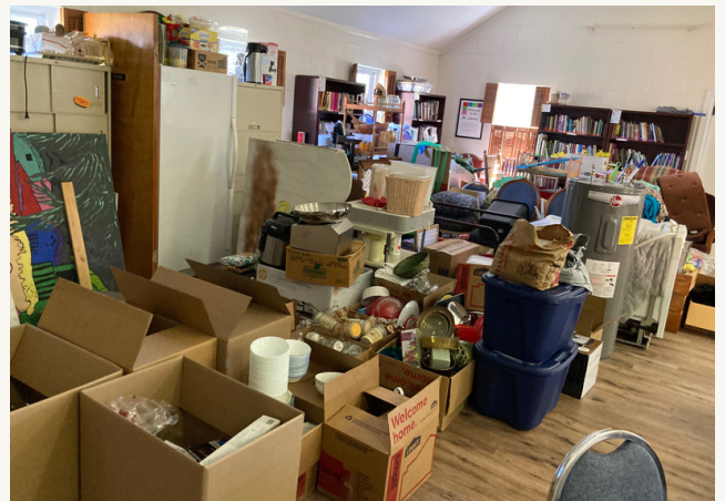
Where is it all going to go?

Many thanks for your perseverance and care for Springwood!